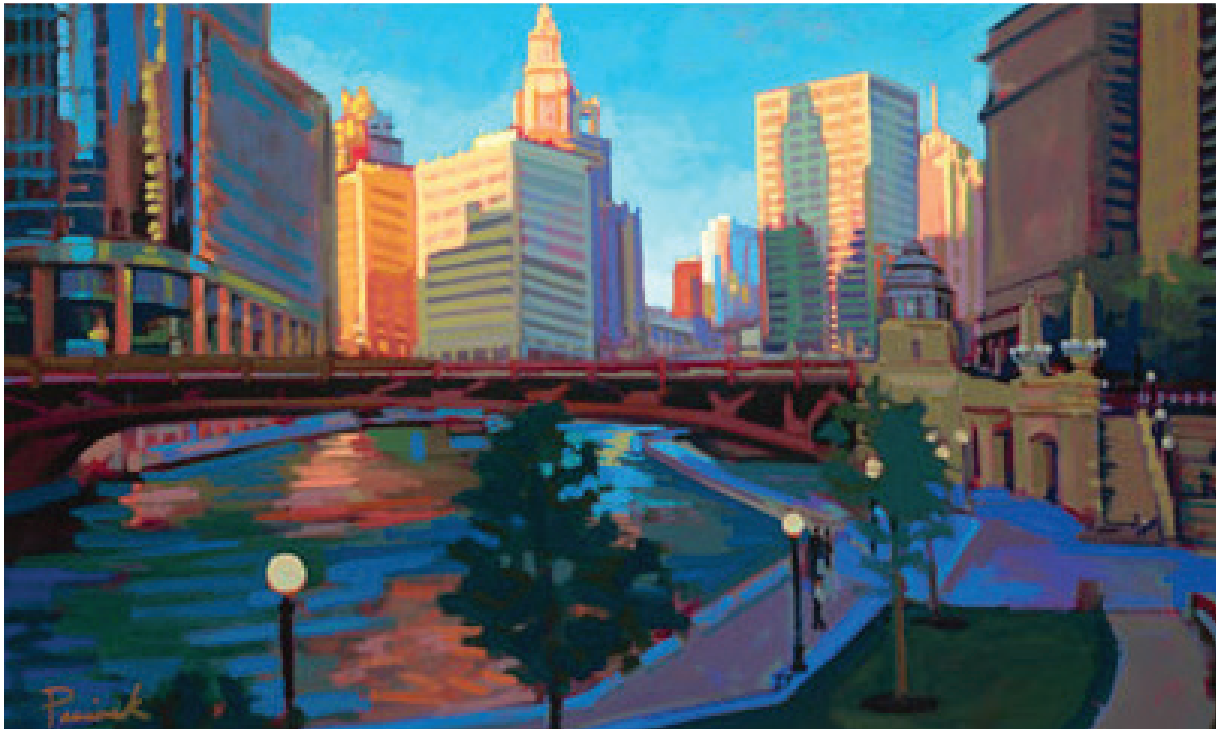
Chicago River Dusk 36" x 58" Oil on Canvas